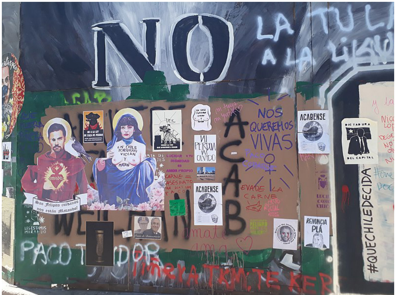
Figure 1. Mon Laferte: En Chile torturan, violan y matan, by Rocio Mantis (2019). Afiches y arte durante las manifestaciones de Santiago de Chile, 2019

Egypt 2011: Aliaa Magda El Mahdy, an Egyptian internet activist and women's rights advocate, published a nude photo where she is dressed in nothing but black-speckled stockings and red ballerina pumps, and with a red flower in her loose hair she looks straight at the viewer. In her blog, under the heading "Nude Art", she refers to this picture and others as "echoing screams against a society of violence, racism, sexism, sexual harassment, and hypocrisy." Aliaa Elmahdy's blog pictures attracted millions of hits and wide-ranging comments, and her picture, together with other similar manifestations, were reproduced through many