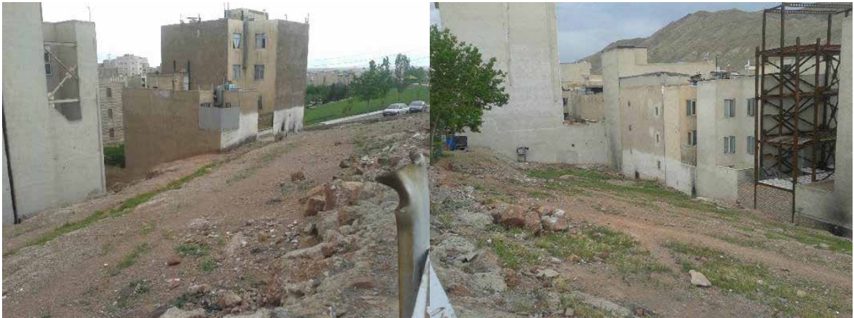
Figure 3 - Unprotected space at the end of the alleys at the foot of Razavieh neighborhood (Fakoori and Bahonar alleys)