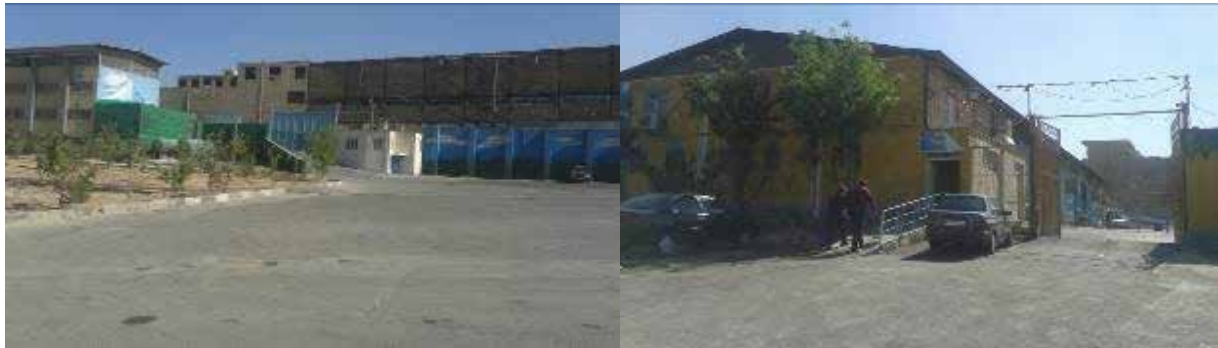
Figure 1 - 750 square meters' area for air conditioning, rest and sports for clients; Helpers of Khavaran

One of the most important issues of Khavaran warming shelter is the lack of management of the presence of addicted homeless people in public and semi-public spaces of Razaviyeh and Moshiria towns. The presence of homeless people and addicts through the construction of greenhouses, the occurrence of crimes such as petty theft, theft and burglary in semi-public local environments weakens security in neighborhoods and urban spaces.