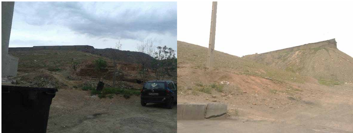
Figure 2 - Foot of Kuhsar hill from Razaviyeh neighborhood (above Fakuri alley)